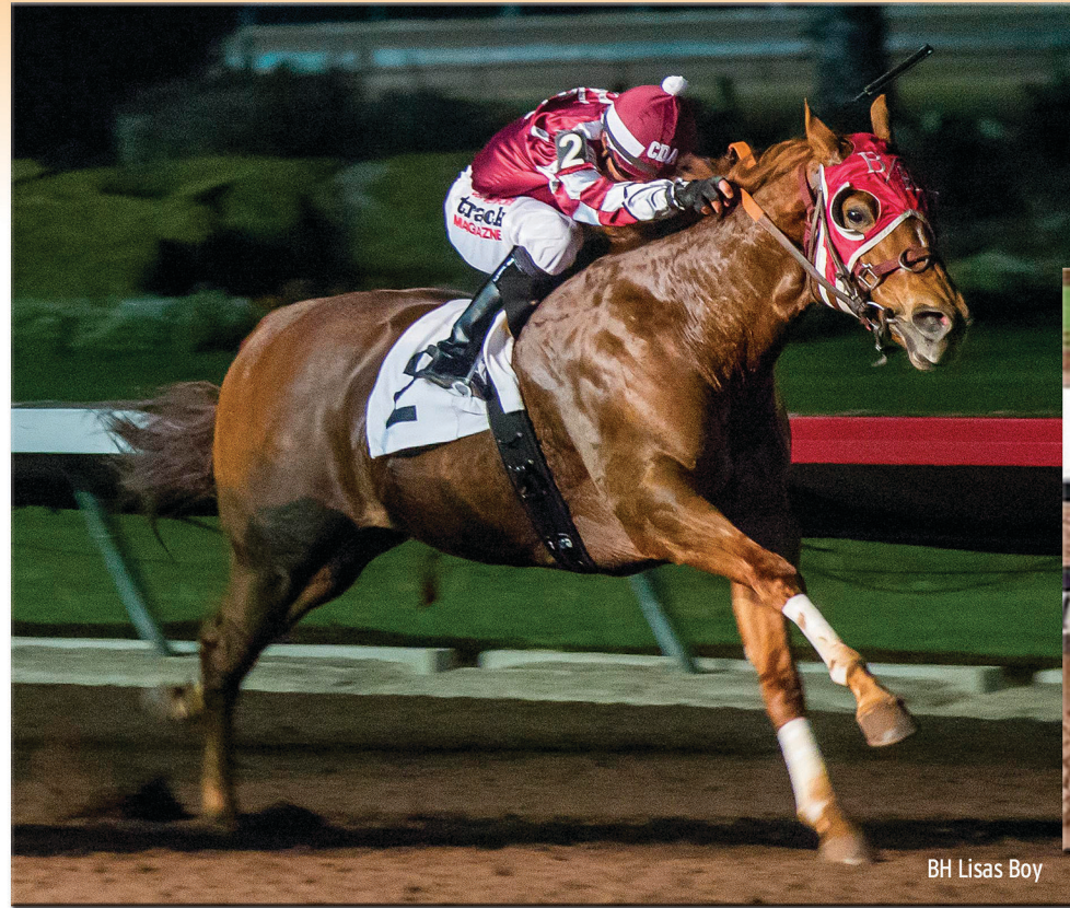
BH Lisas Boy