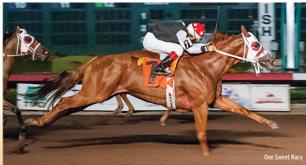
One Sweet Racy